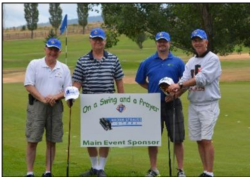
The Knight of Columbus 6th annual Golf Tournament, "On a Swing and a Prayer" was a success again this year. The event grossed nearly $15,000 and with a few final funds out yet, we anticipate netting $11,000.