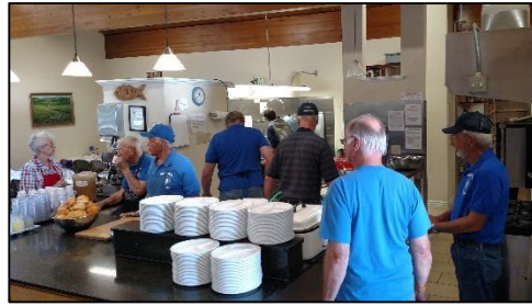
Brothers of Council 1663 serving the community at the St. Mark's soup kitchen of Idaho Falls on Saturday, August 1st.