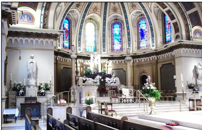
Saturday's Ladies program at St. John the Evangelist Cathedral, Diocese of Boise. It has been renovated and many items were hard to match but they did an amazing job.