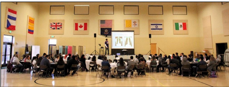
The Confirmation Retreat at Our Lady of the Valley Catholic Church in Caldwell Idaho.