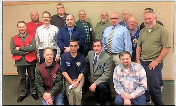
Sixteen new 3rd degree Knights from area councils.